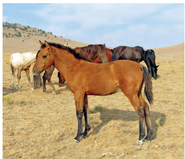
LEFT TO RIGHT: Herding to the Summer Pasture ; The bay dun gelding Bar Non Traveler (TruWest Silver Suede x Bar Non Windy Spring), pictured as a foal on summer pasture with part of the Bar Non broodmare and foal band, summer 2012.